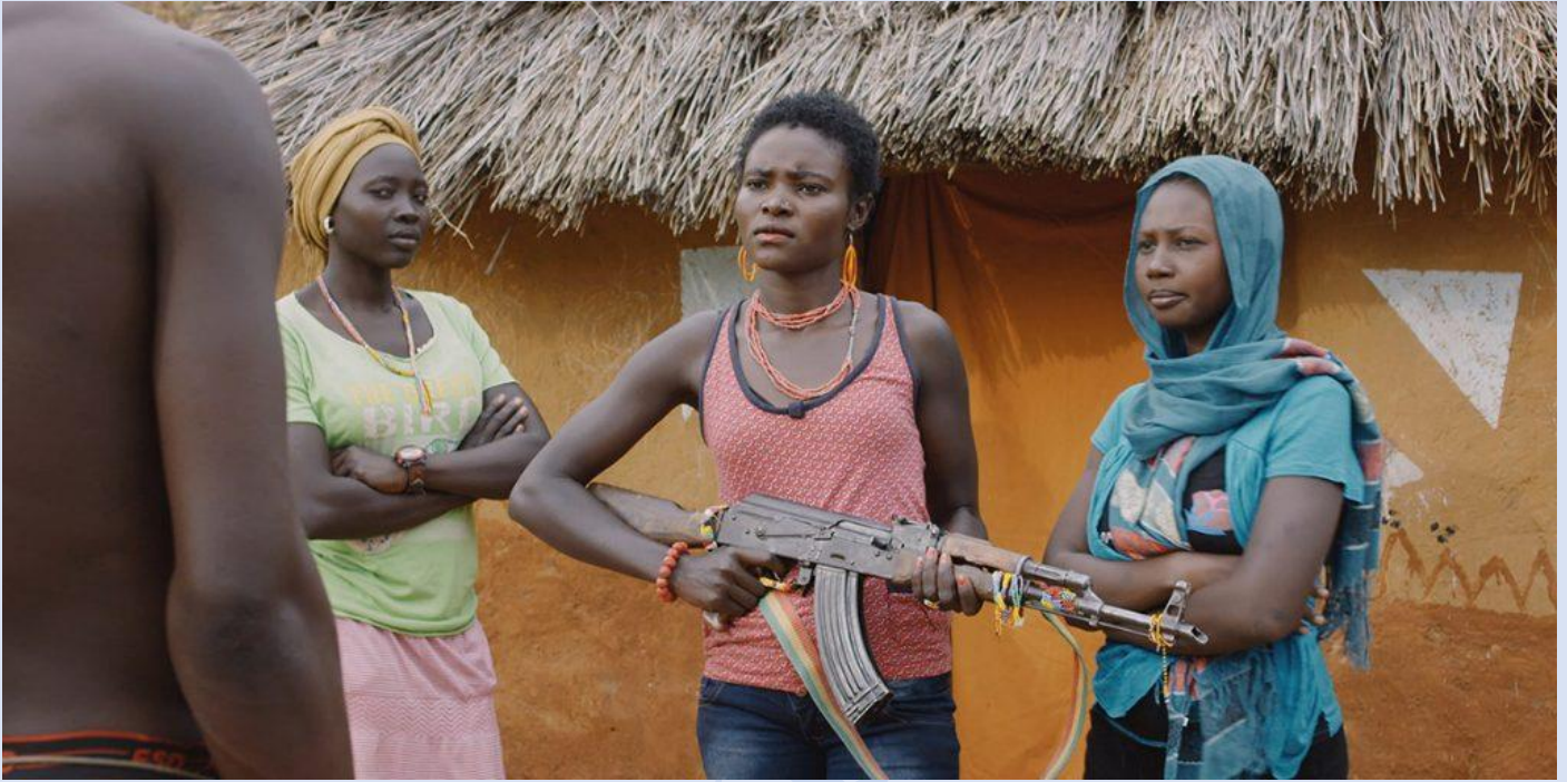
aKasha (Sudan, 2018)

Arab cinema does not only comprise cinemas from the land of Arab but also accommodates several countries from the Middle East and Africa. Arabic cinema implies cinema in Arabic language. That comprises countries like Saudi Arab, Syria, Lebanon, Kuwait, Qatar, Oman, Emirates, Afghanistan, Egypt, Sudan, Libya, Algeria, Tunisia, Morocco, Mauritania etc. The linguistic implications of the regional variety are various and sundry. The Middle East is always fighting among them, along with being overburdened with stringent Islamic fundamentalism. Whereas North Eastern Africa is relatively free from this fundamental mentality.